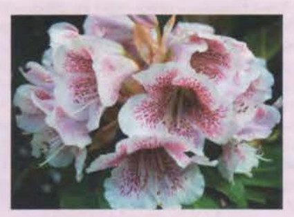
Alan Campbell continues the story of hybridizers on Vancouver Island. Page 133.

Eastern Regional Conference October 21–23, 2011 Sandstone, VA Registration form on page 149