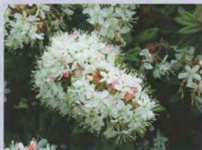
Don Voss creates a provisional key for dealing with the taxonomically troublesome Ledum on page 99.